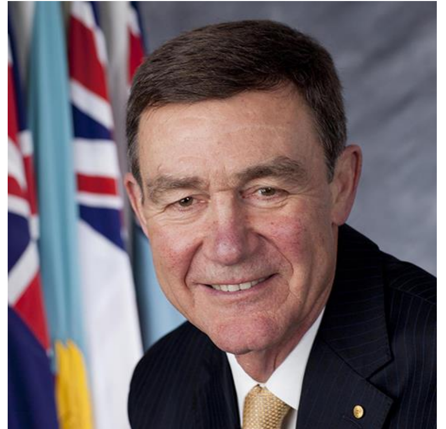
Air Chief Marshal Sir Angus Houston AK, AFC (Ret'd)